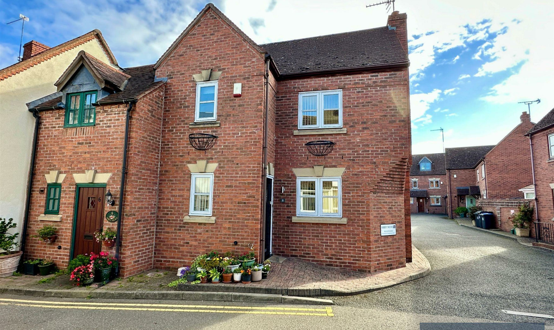
Abbey Mews , Alcester, B49 5BY